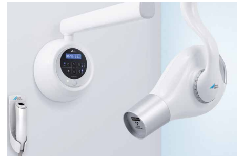
Image plate holders from Dürr Dental offer optimum protection for the image plate with their smoothed and rounded edges. Holders are available for all applications – their use helps to ensure that accurate X-ray images are produced.